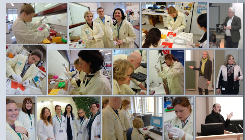
@BBMRI.at - Course Impressions