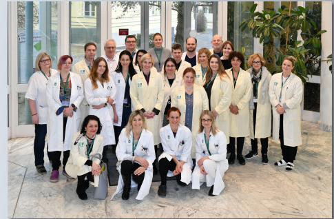
@BBMRI.at: Group Picture "Pre-Analytics Course 2017"

Sponsors: QIAGEN & PreAnalytiX, (main sponsors), HVD GmbH, AlphaMetrix, Roche