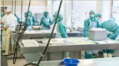
@Roel Fleuren/ Science Transmitter/Nature